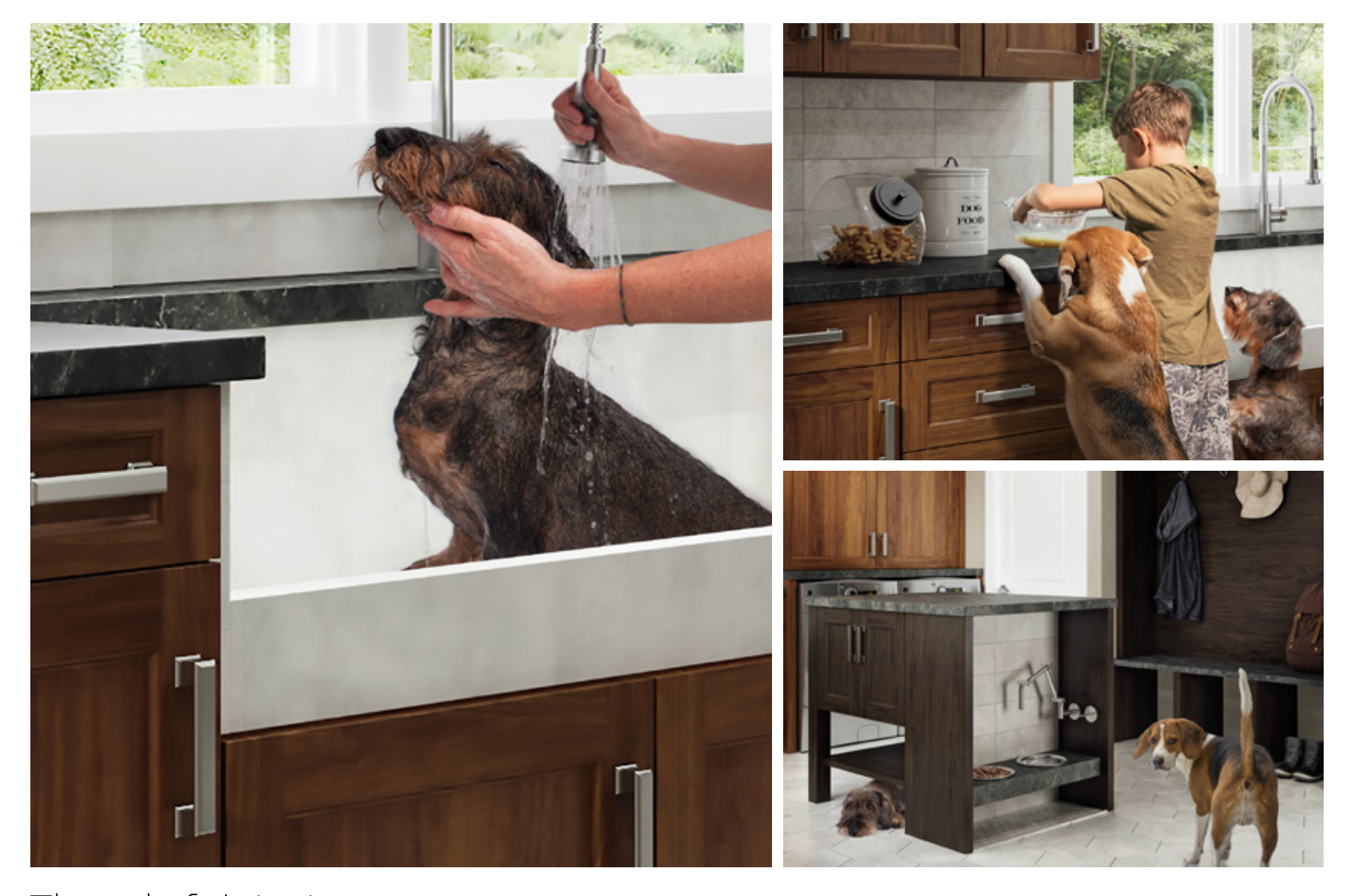
Thoughtful design A well thought out design will lead to a space that truly fits the way you live. This mudroom serves the needs of all family members, which of course includes your pets. Besides storage and laundry, it also features a low sink which is well suited for pet bathing, and an island that accommodates a food and water station.