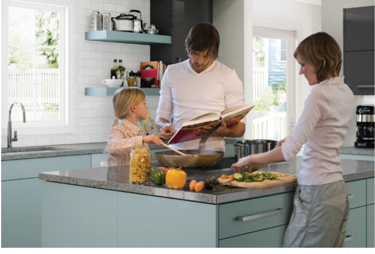
A touch of reflection The high gloss finish of the wall cabinets provides the perfect accent to the matte surfaces of the island and base cabinets, illustrating the main characteristics of the Allure and Suede finishes. A floating base cabinet keeps everything visually light and open. Directly above it, the wall cabinet features a lift mechanism which moves the door up and out of your way, allowing full access to the interior. Several different door lift options are available.