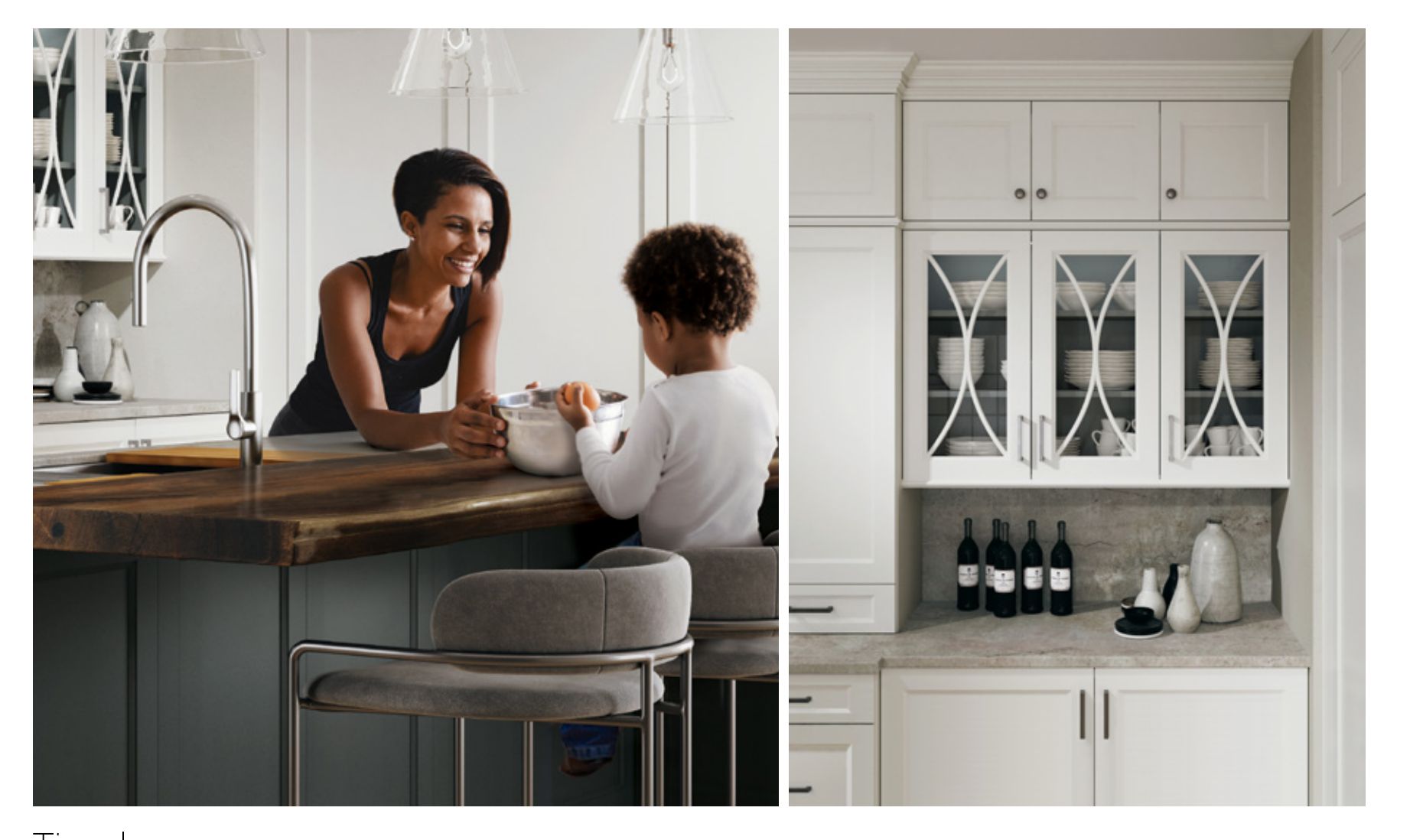
Timeless The Portland door style can help you design a space that feels fresh and current, yet still seems familiar and rooted in tradition. The deep tones of our Fog paint on this island provide a rich accent to the Snow paint of the perimeter cabinets. The double bow mullions of the glass doors add a modern touch that celebrates old world craftsmanship. A variety of unique mullion styles are available giving you great design flexibility.