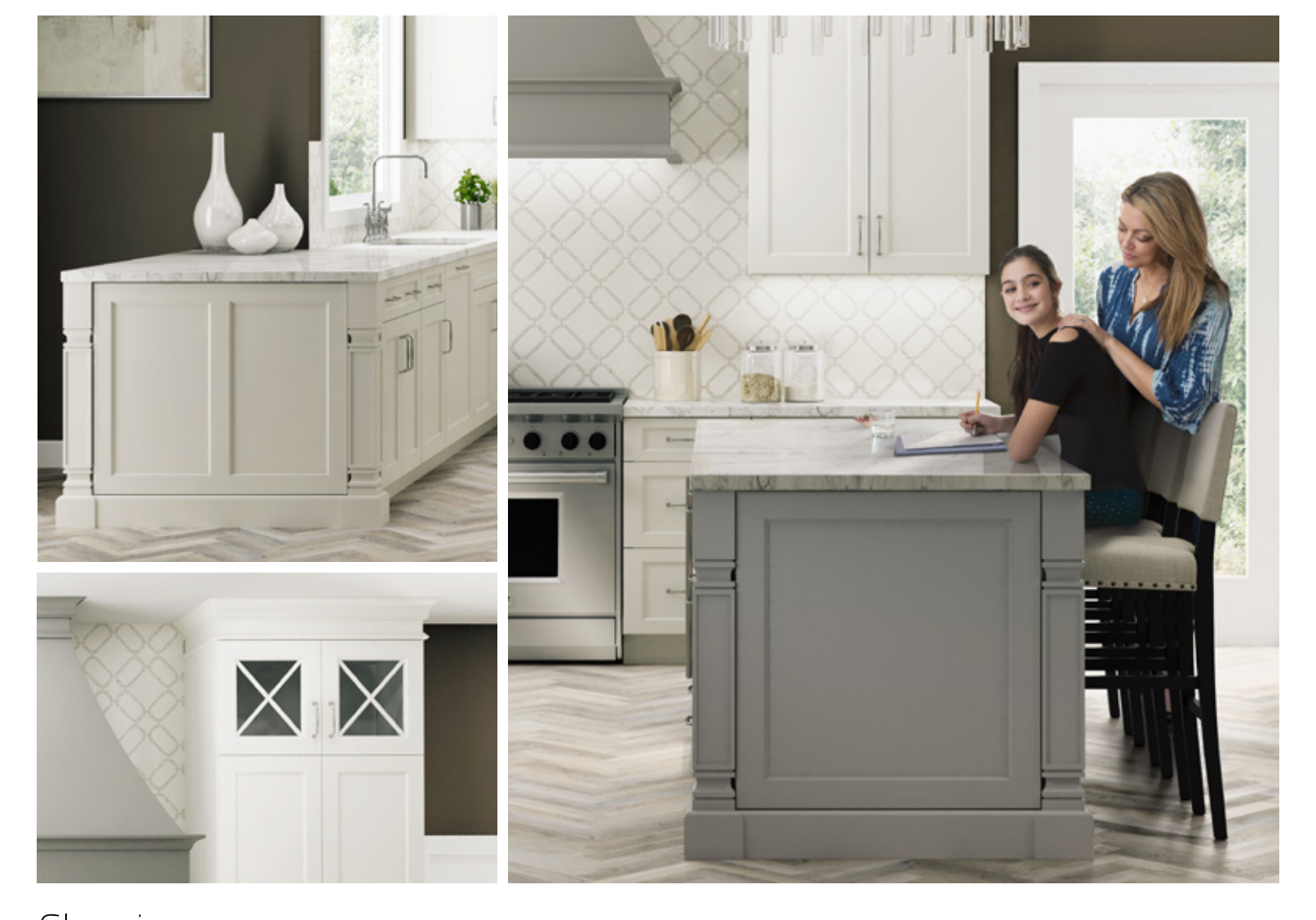
Classic The classic detailing of this elegant kitchen may be your path to creating a kitchen that fits your personal style. Furniture legs, finished end panels and base molding add beautiful detail to the island and create artful transitions at the corner of the base cabinets. Crown molding and mullion doors, with clear glass and opaque panels, add to the traditional charm.