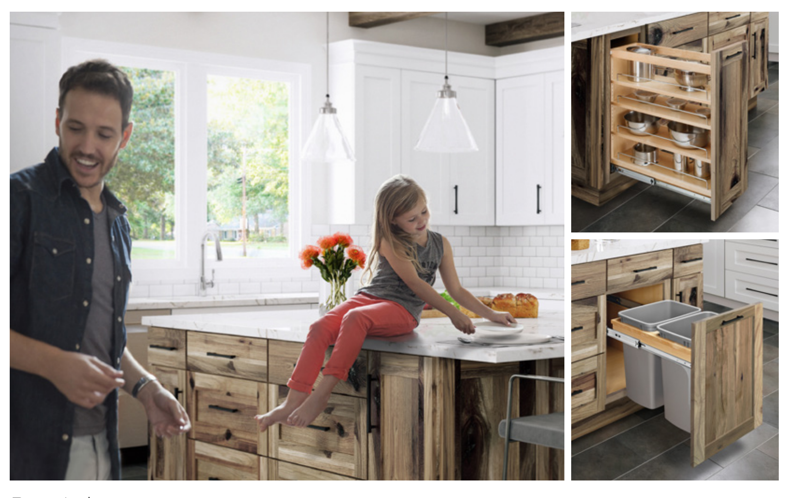
Rustic by nature Knotty wood is a beautiful reminder that the materials of your cabinets are unique creations of nature. This Knotty Hickory island is the focal point of the room, framed by a backdrop of white painted cabinets. If a rustic look fits your personal style, we also offer Knotty Alder and Knotty Cherry. The intricate grain of this Hickory island showcases our proprietary Aged finish. This process enhances the naturally occurring characteristics of the wood, resulting in a finish that is completely unique on each individual cabinet.