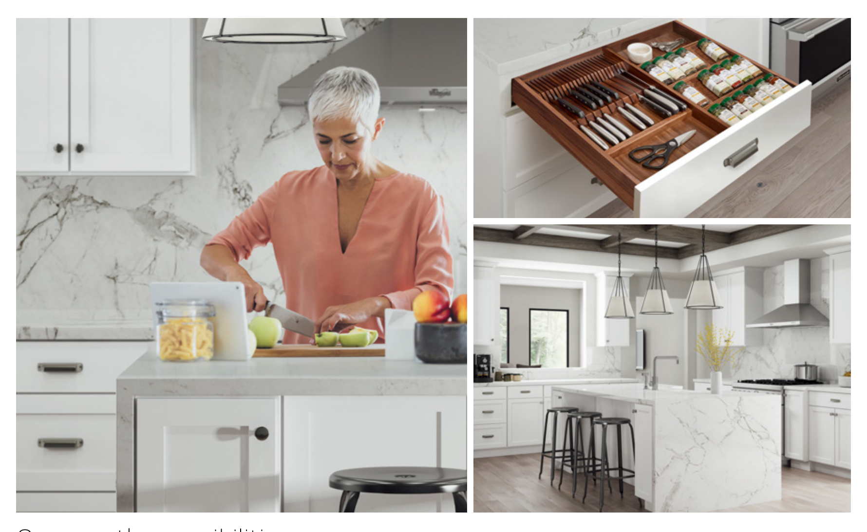
Open up the possibilities If you're looking for a light filled space, consider white cabinetry, an architectural pass through and an open floor plan. The clean lines of the simple shaker door style create well defined shadow lines and crisp highlights. Walnut drawer boxes and walnut organizers are affordable luxury touches for those who appreciate the qualities of this valued species.