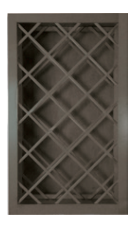
12" D Wall Wine Racks WR3018 (Horizontal Installation) WR1830 (Vertical Installation) Note: Holds 18 to 20 bottles