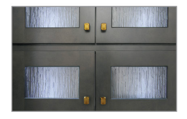
Prep for Glass Doors PFG (Glass not included)