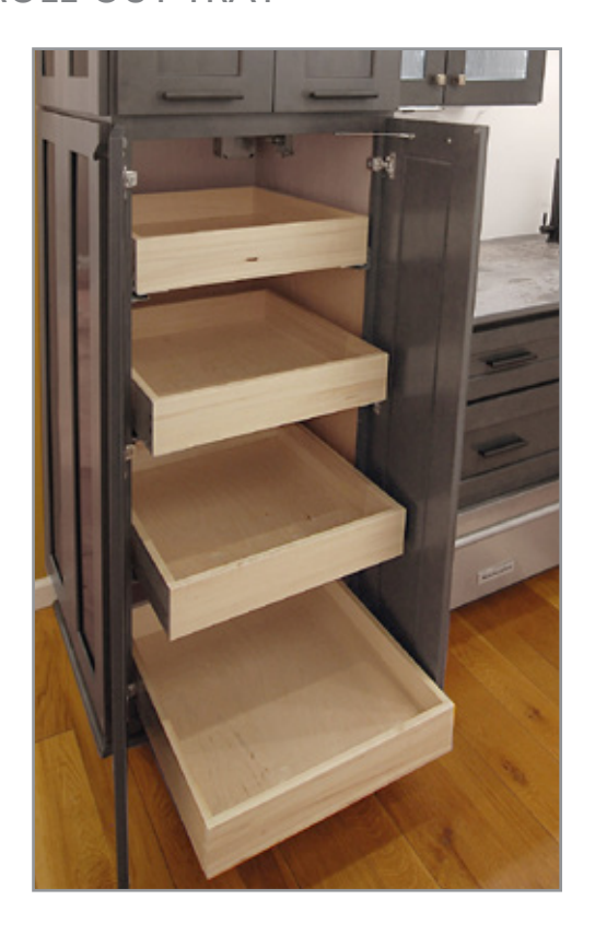
ROT B15 ,ROT B18 ,ROT B21, ROT B24, ROT B27, ROT B30, ROT B33, ROT B36