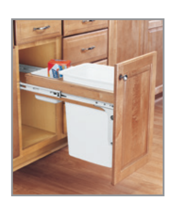
Single 35 Qt Waste Container 4WCTM-12DM1-21 White Container Fits in Base 15