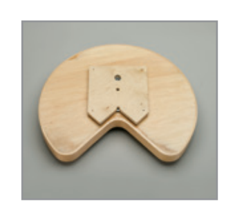
28" Banded Wood Kidney Susan LD-4BW-401-28SBS-40

Both Susans attach to cabinet shelf or floor and have a steel bearing. They fit wall and base corner cabinets.