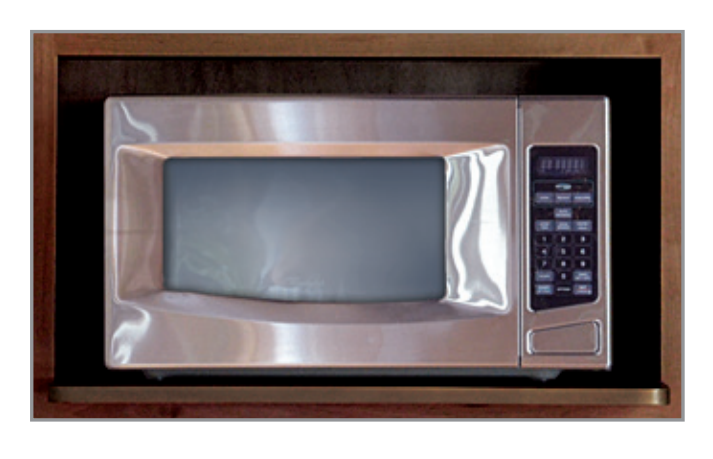
MWS3018X12 18" H X 12" NOTE: SHELF IS 17" D