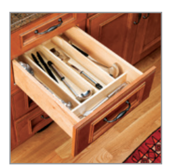
18 1/2"W X 22"D Utensil Organizer 4WUT-1SH 24"W X 22"D 4WUT-3SH