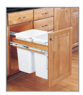
Double 35 Qt Waste Container 4WCTM-18DM2-18 White Container Fits in Base 18