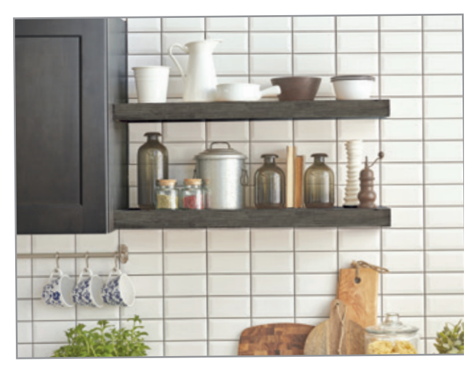
Available Widths 24", 30", 36" Shelves are 10" deep and come with installation bracket.