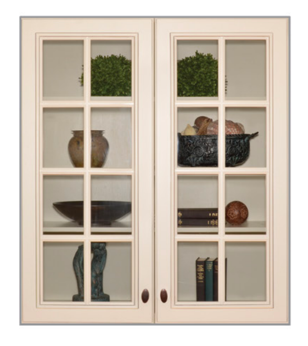
Mullion Doors MULL (Available in Hampton door style only)