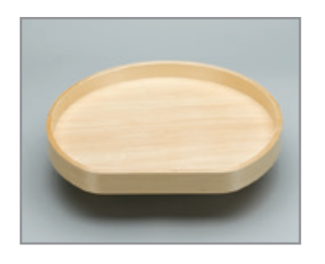
20" Banded Wood D Shaped Susan LD-4BW-201-20SBS-8