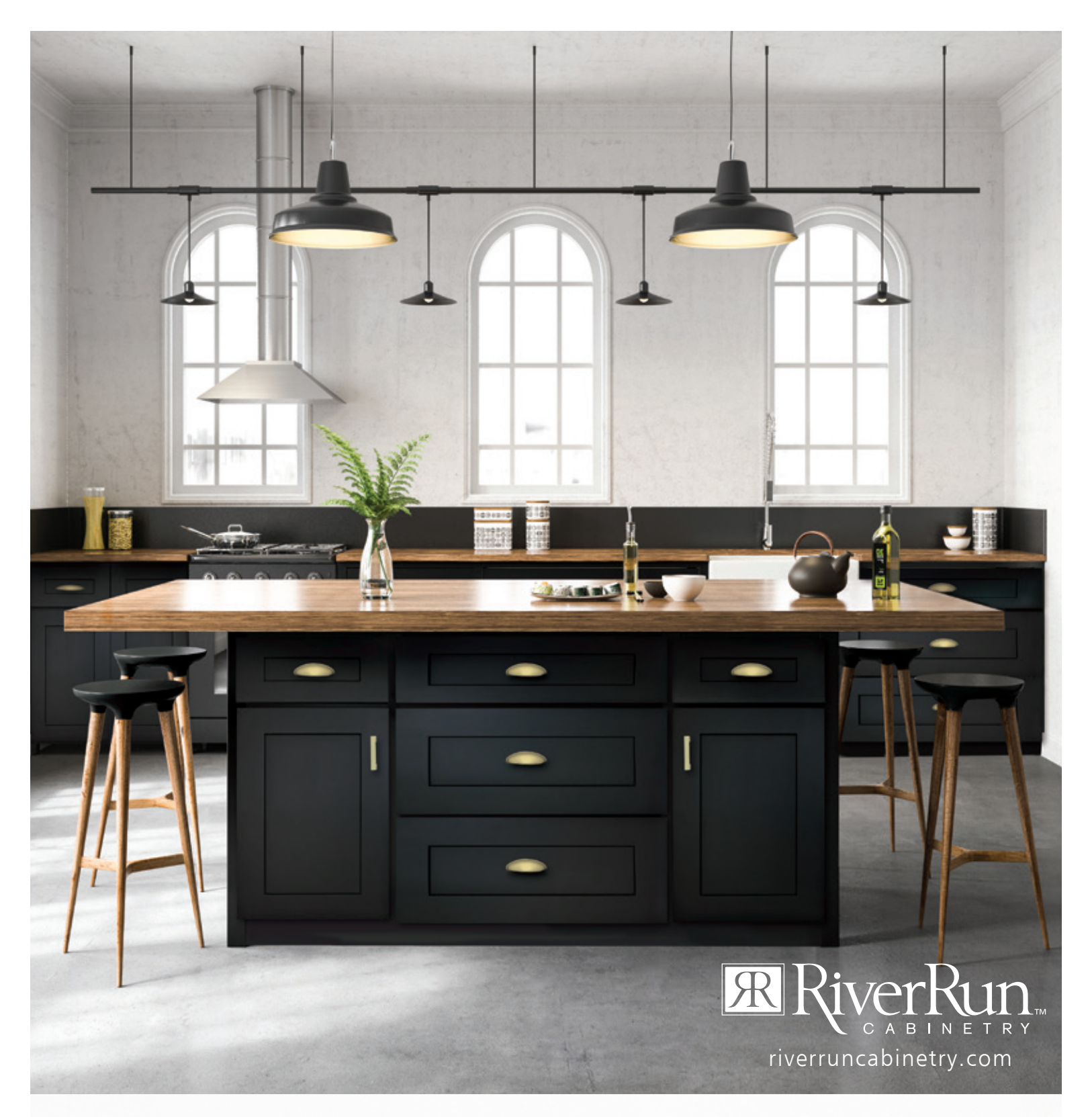
Ask your RiverRun dealer about special order options.