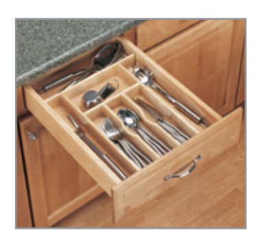
14 5/8"W X 22"D Wood Cutlery Tray 4WCT-1SH 20 5/8"W X 22"D 4WCT-3SH