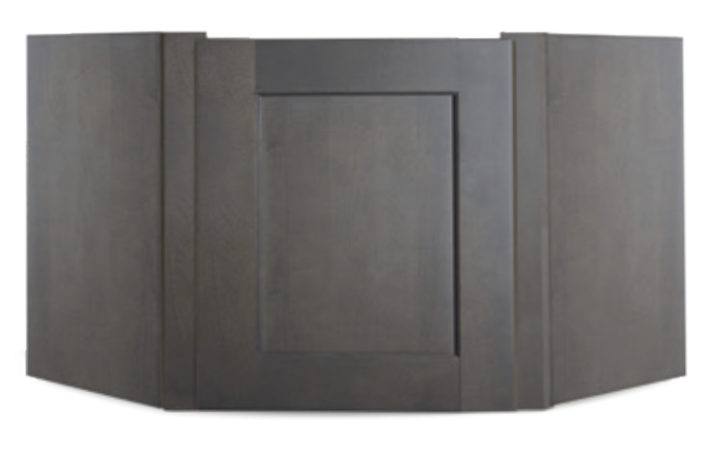
ADAG Note: Single door hinged to side stile