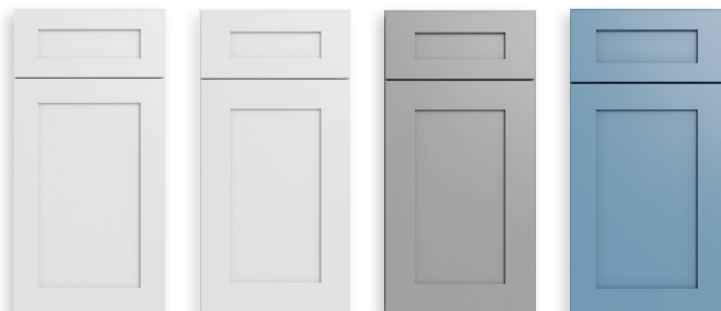
Vista White Shaker