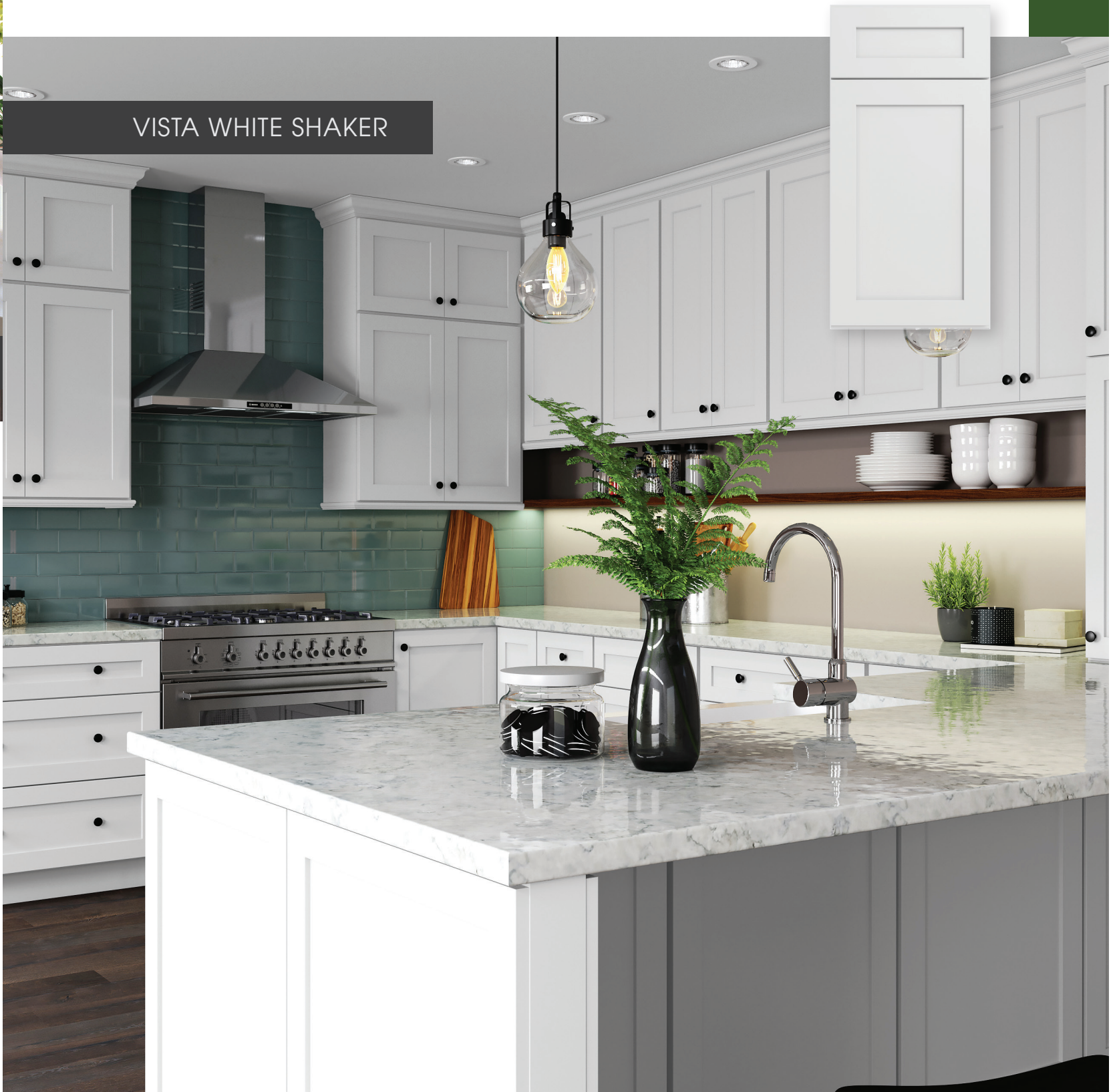
VISTA WHITE SHAKER

Images are for illustration purposes only. Print and digital representation of color, specification, and/or wood grain may vary from the actual product.