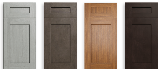
Nova Light Grey Shaker