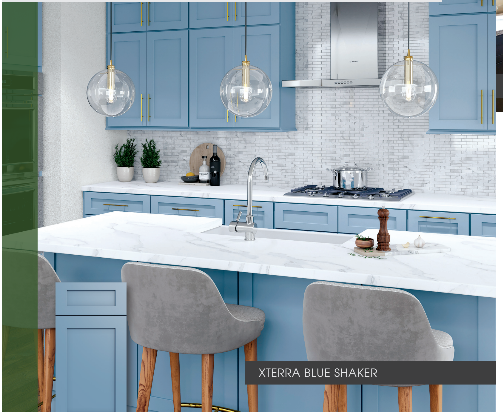
XTERRA BLUE SHAKER

The Shaker collection features a clean, simple design that pairs well with any layout or color scheme, and is adaptable enough for use in both traditional and modern homes. This collection is available in a variety of colors and produces endless modern possibilities to a classic shaker design.